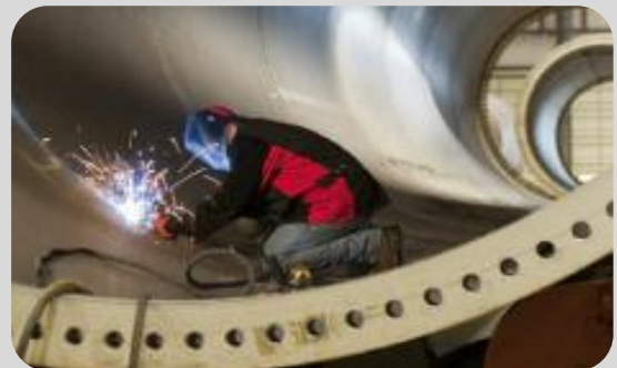
A welder works on a wind turbine. Lincoln Electric is one of the world's largest suppliers of welding and cutting equipment to the wind tower industry.